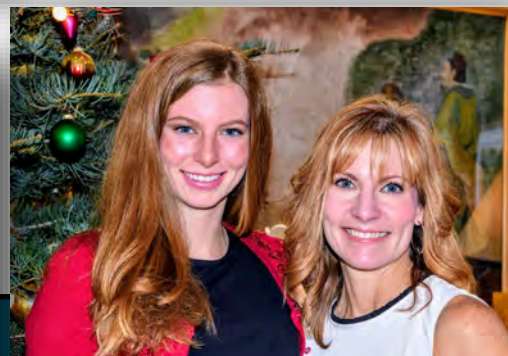
Seniorita