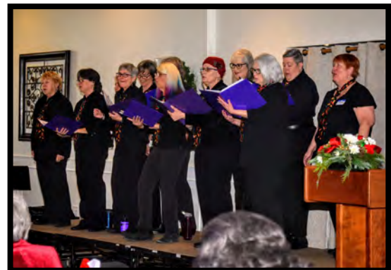
Luncheon