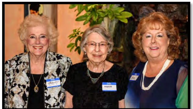
Luncheon