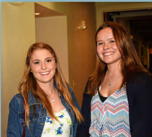
Senorita