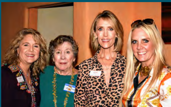
Luncheon