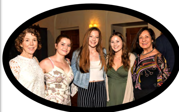
Senorita