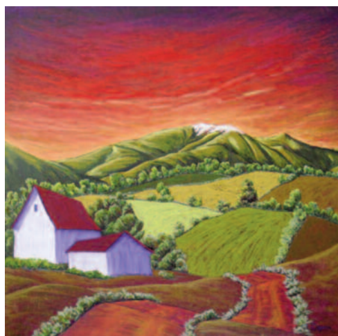
2009 Music from Angel Fire Poster Art