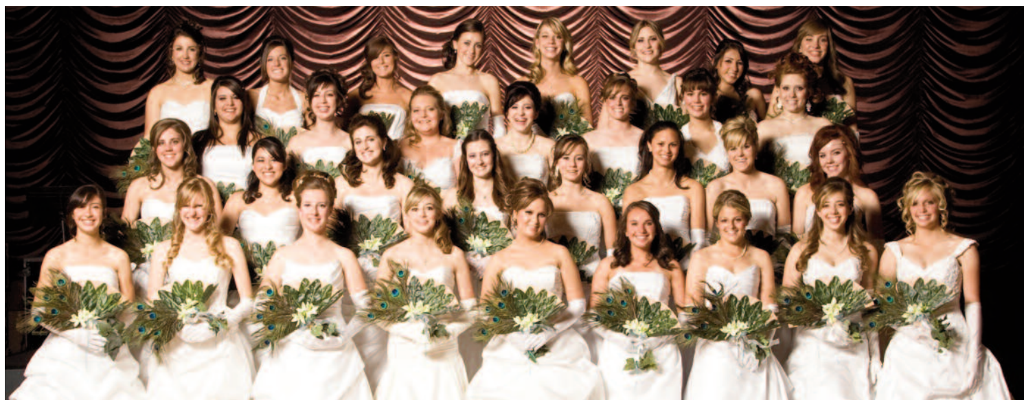
Señoritas of the Symphony