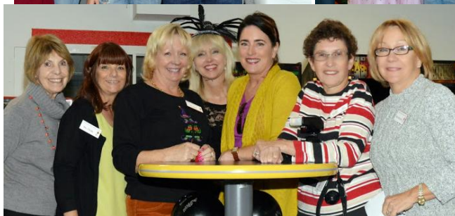
Auntie Mames and Señorita Chairs