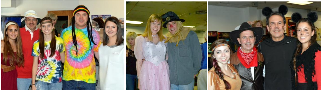
Halloween Bowling with Dad