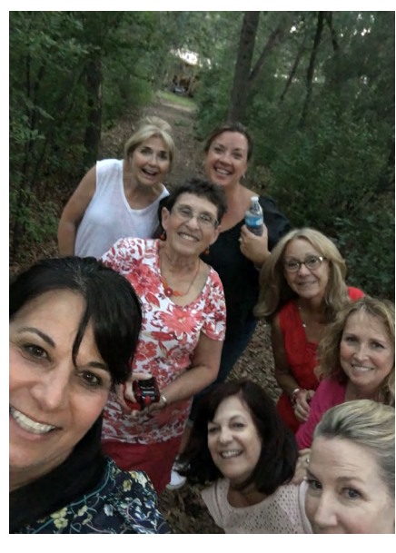
We began the evening with a short walk down to the river, just below the faculty cabins where the Board spent the night and began working on plans for the future of the Music Guild of New Mexico.