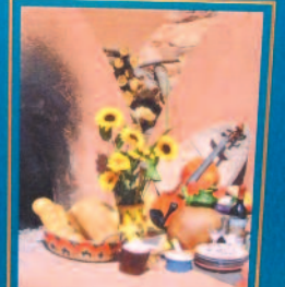
he New Mexico Symphony Guild Albuquerque, New Mexico

A Symphony of Flavors From the Southwest