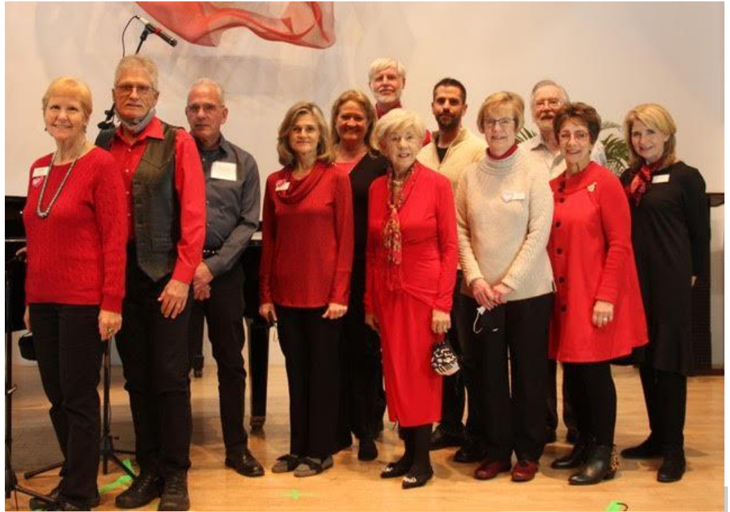
2021 JMYAC Volunteer Team

2/20/2022, 3:00pm Immanuel Presbyterian Church 114 Carlisle Blvd SE / Albuquerque, NM 87106 For tickets go to: www.NMPhil.org