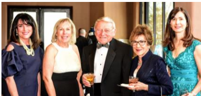
New 2022 Señorita Ball pictures at: https://www.musicguildofnewmexico.org/galleries/senoritas/2022-senorita-ball