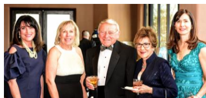
New 2022 Señorita Ball pictures at: https://www.musicguildofnewmexico.org/galleries/senoritas/2022-senorita-ball