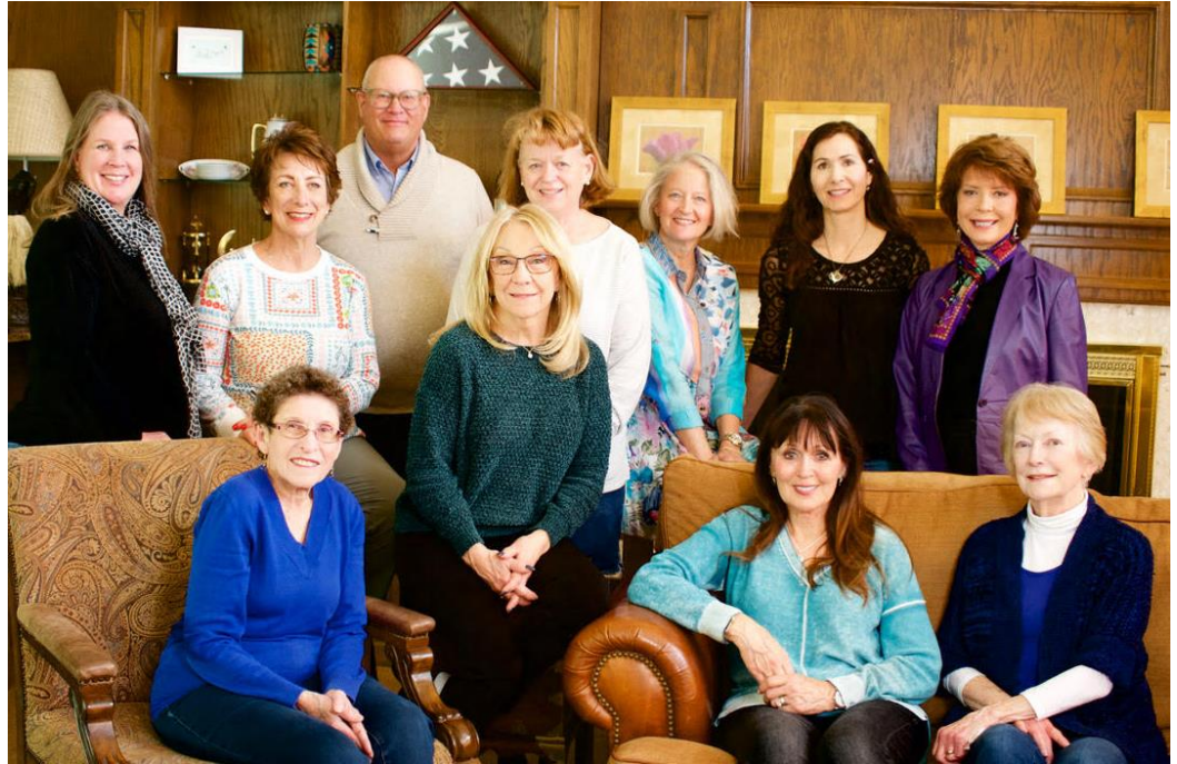
2022 Señorita Ball Committee