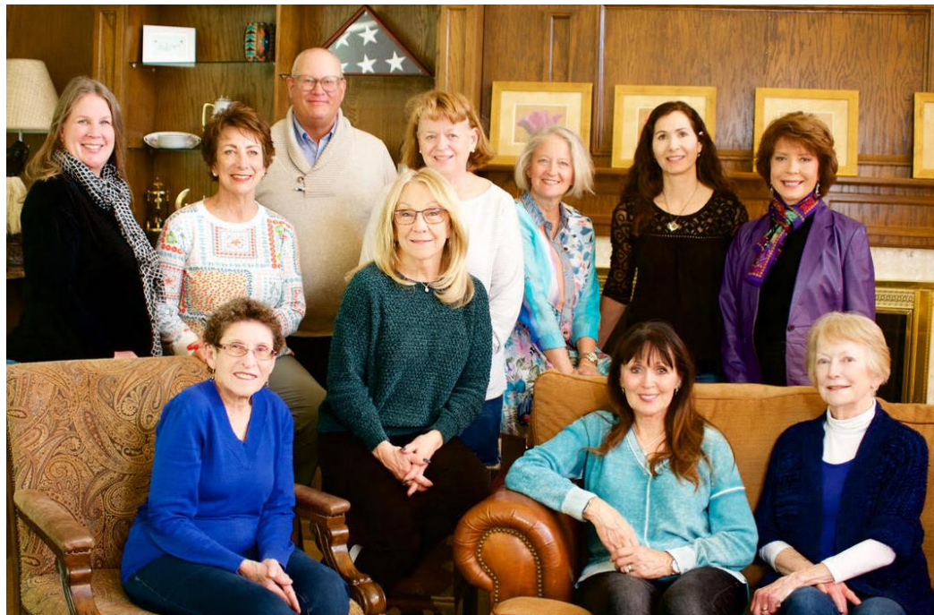
2022 Señorita Ball Committee