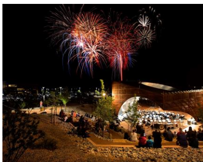
Sky Room Amphitheater in Rio Rancho, New Mexico